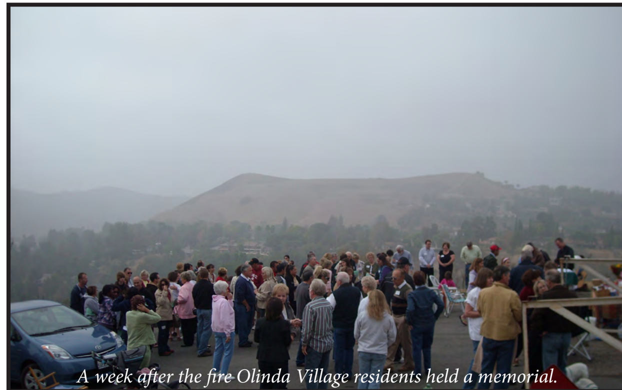
A week after the fire Olinda Village residents held a memorial.