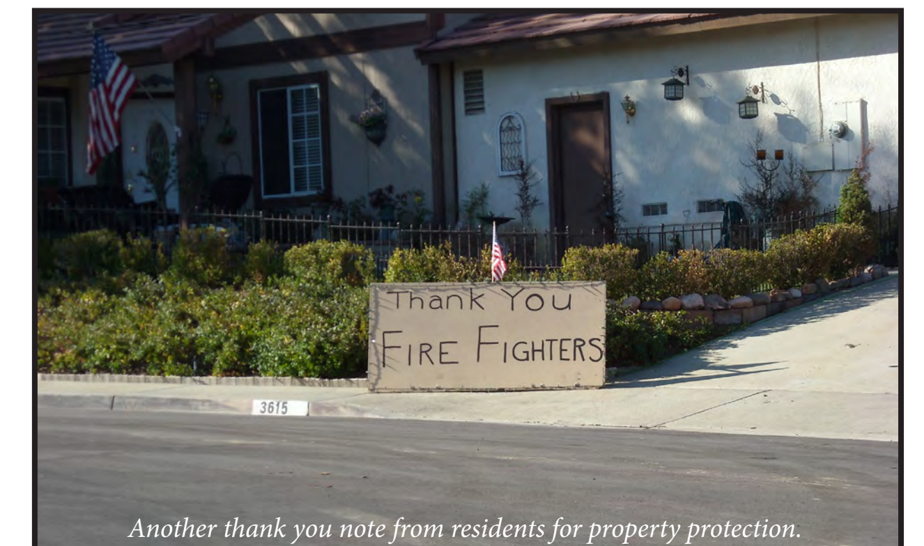
Another thank you note from residents for property protection.