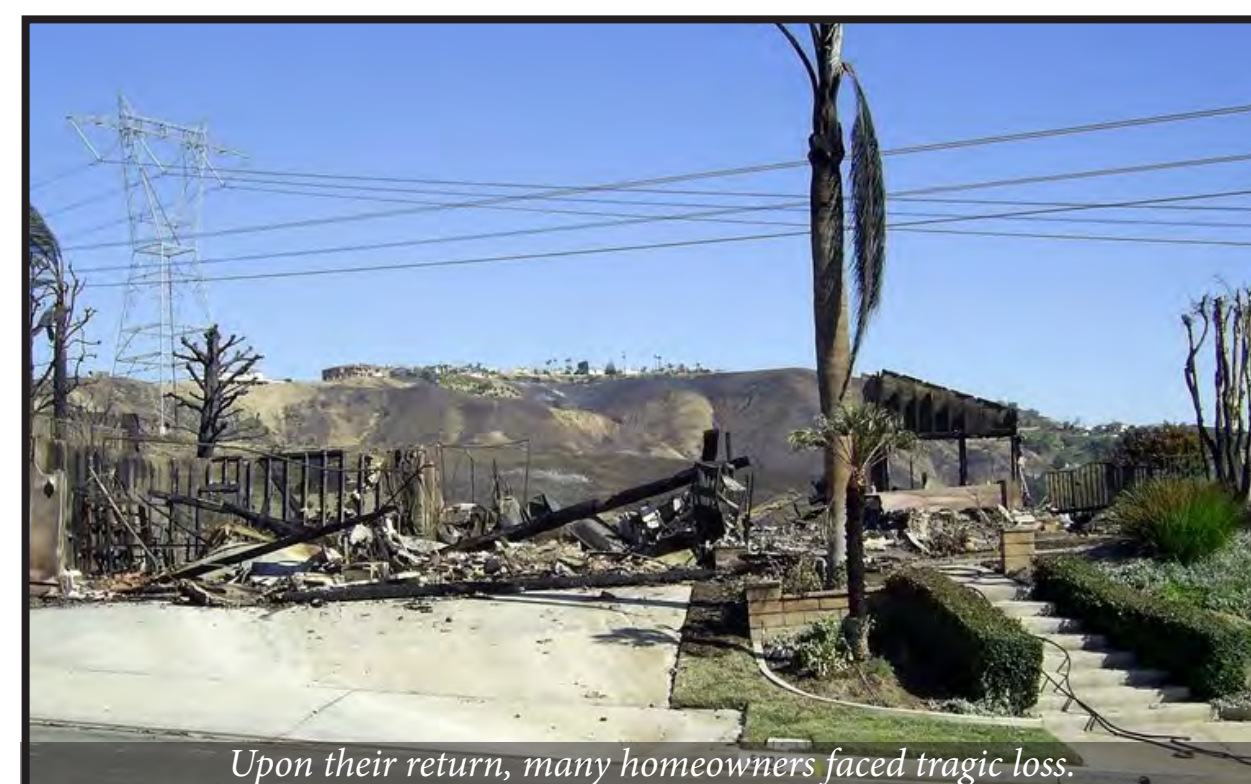
Upon their return, many homeowners faced tragic loss.