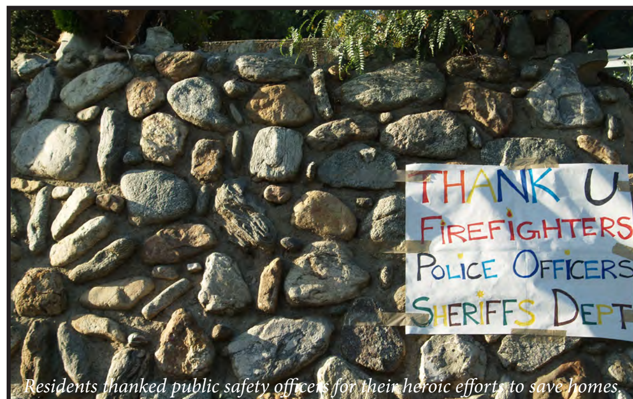
Residents thanked public safety officers for their heroic efforts to save homes.