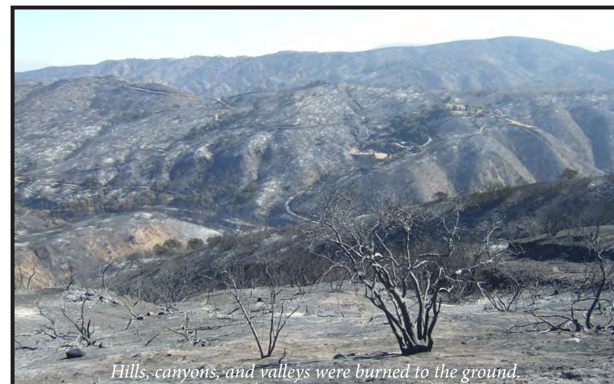
Hills, canyons, and valleys were burned to the ground.