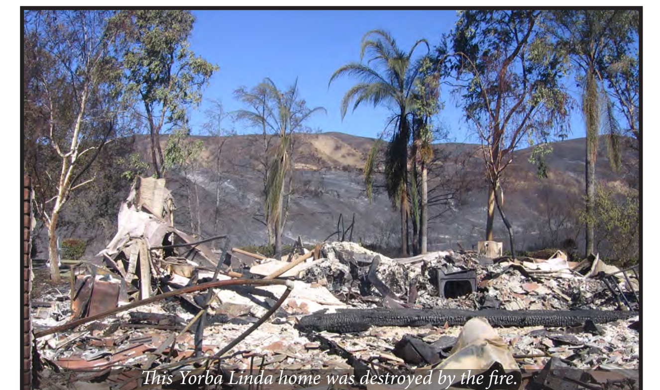
This Yorba Linda home was destroyed by the fire.