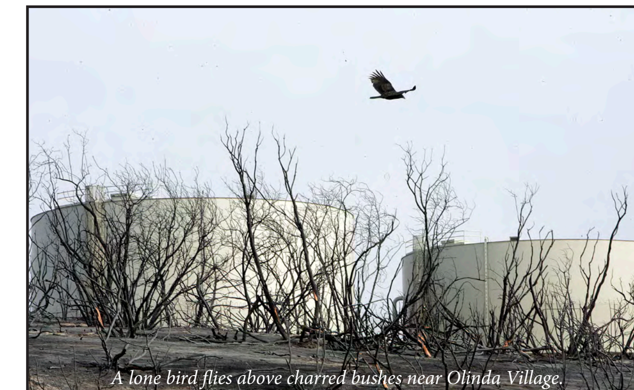
A lone bird flies above charred bushes near Olinda Village.