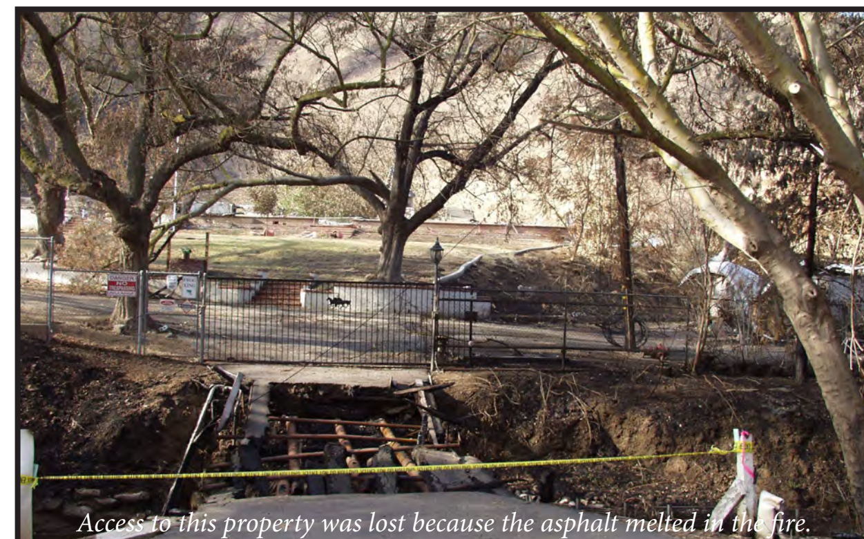
Access to this property was lost because the asphalt melted in the fire.