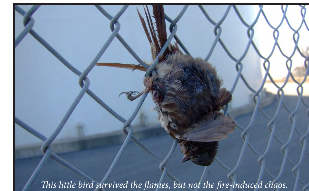
This little bird survived the flames, but not the fire-induced chaos.