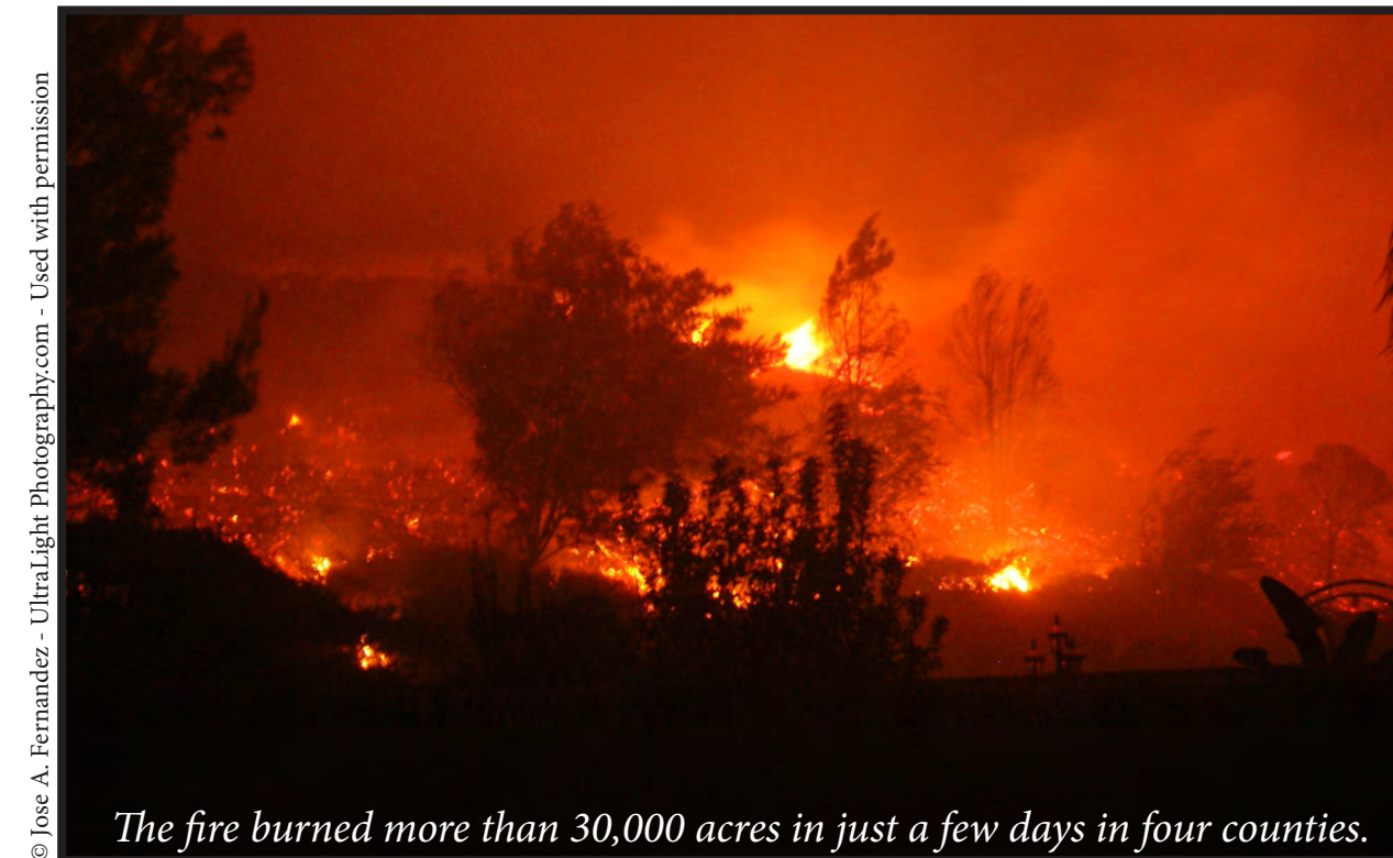
The fire burned more than 30,000 acres in just a few days in four counties.

Commemorating the 10 Year Anniversary of the November 2008 Freeway Complex Fire.