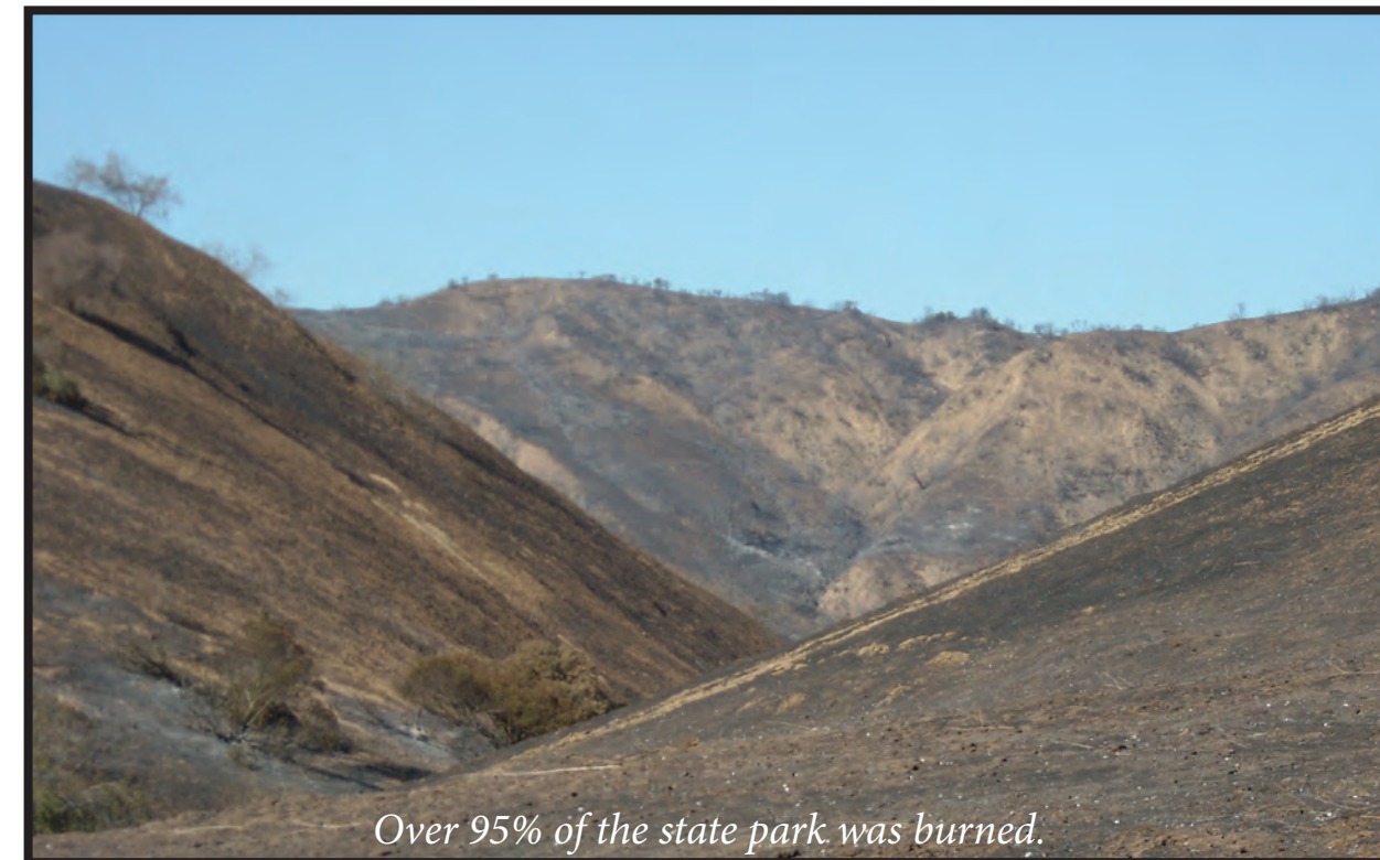
Over 95% of the state park was burned.