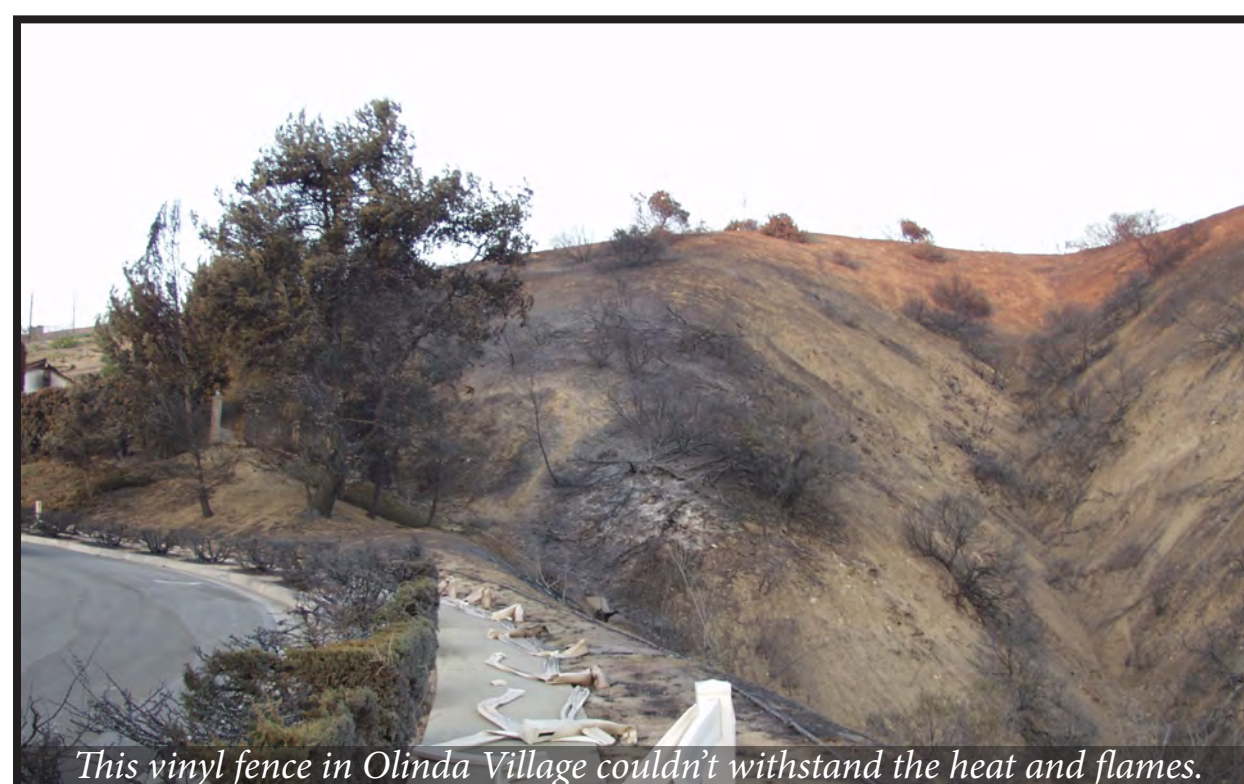
This vinyl fence in Olinda Village couldn't withstand the heat and flames.