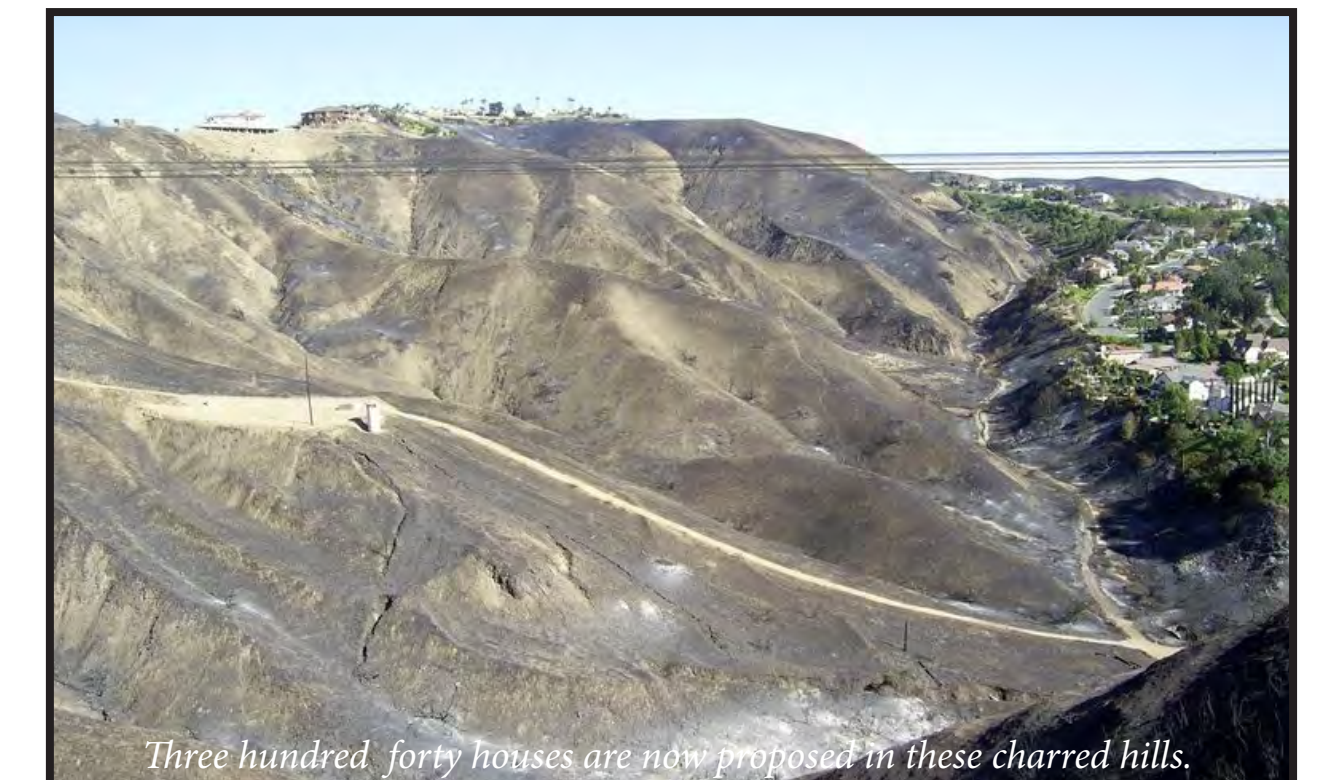
Three hundred, forty houses are now proposed in these charred hills.