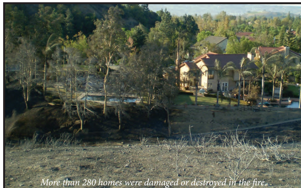
More than 280 homes were damaged or destroyed in the fire.