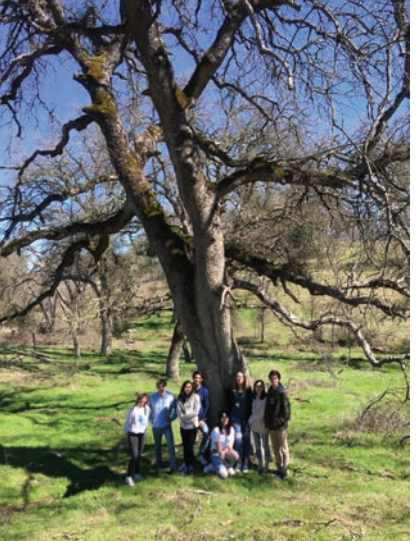
Defenders of the oak woodland

It is here that Ed Abbey's famous tenet: "The idea of wilderness needs no defense, it only needs more defenders," is fitting for the work of oak woodland conservation, which needs more defenders. For Oaks readers that sentiment likely seems obvious, but it was powerful to witness dozens of students,