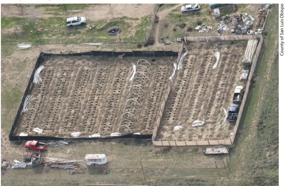
Abandoned cannabis grow site, California Valley, Carrizo Plain