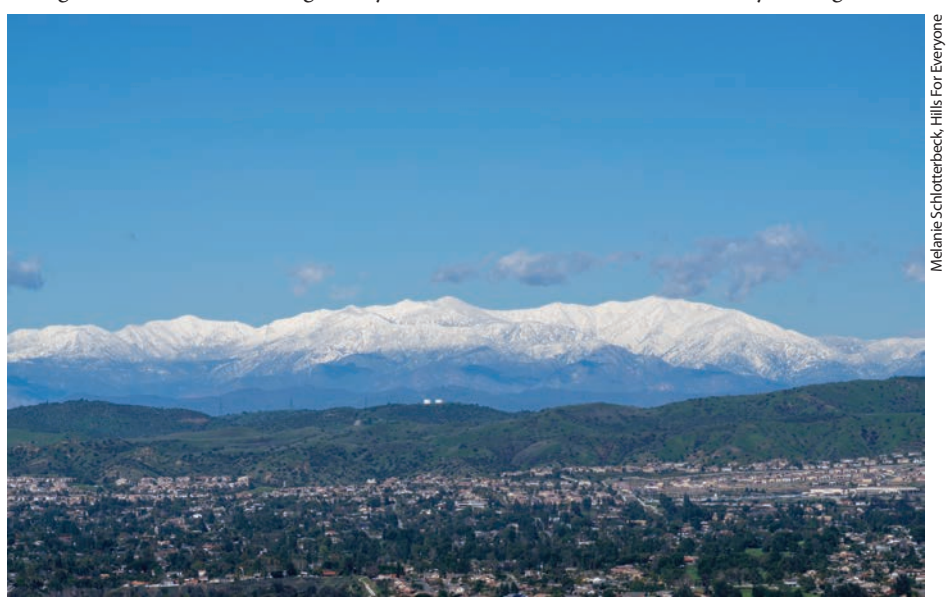
The rolling hills of Chino Hills State Park are quite a sight to see in the spring.

The lesson we have learned over the past 40 years is to evolve—evolve your thinking, strategies, and tactics, and success will follow. We are grateful to be a member of the California Oaks Coalition. Learn more at: www.HillsForEveryone.org.