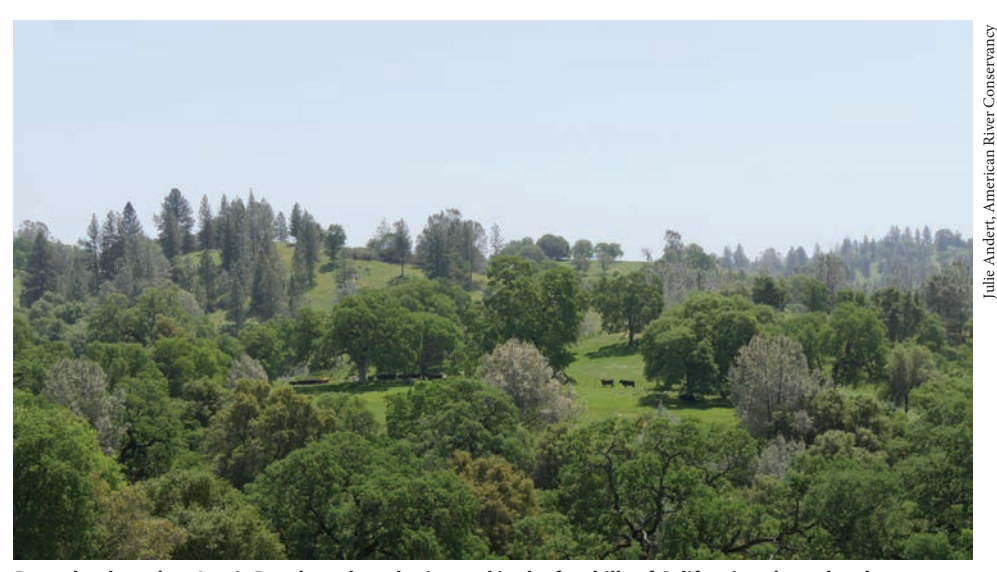
Rangelands such as Lewis Ranch are largely situated in the foothills of California, where development pressures threaten high-conservation-value oak woodlands and riparian corridors.

Williamson Act lands are not necessarily protected, thus differing from lands under conservation easements. For example, Williamson Act enrollment does not guarantee the conservation of a property's oak woodlands. Further, the future of these lands is uncertain, both because of the temporary nature of the enrollment—unlike land under conservation easements, which are held in perpetuity—and also because of the cessation of state funding for counties during the Great Recession.