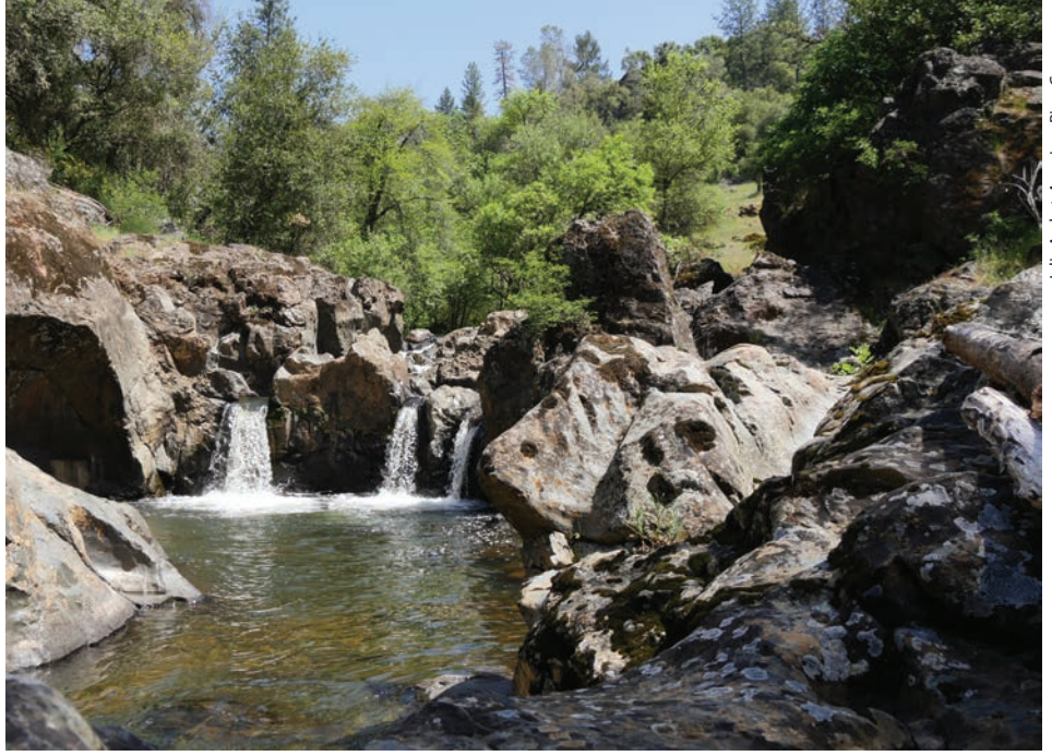
Greenwood Creek, a major perennial tributary to the South Fork American River, at the Lewis Ranch.

Carbon Farming, Cannabis on the Carrizo Plain