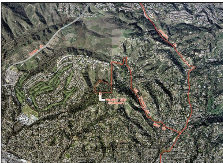
City of La Habra Heights

Matrix has moved east from Whittier, proposing an oil re-development project on old gas company property located at the end of Las Palomas in La Habra Heights. Matrix hopes to drill up to 30 wells necessitating transport of the crude oil in 18 wheelers through the narrow Heights streets. The operation is proposed to last up to 30 years and will run 24 hours a day. The Environmental Impact Report is being written now. Residents opposing this project have created a website www.HeightsOilWatch.org .