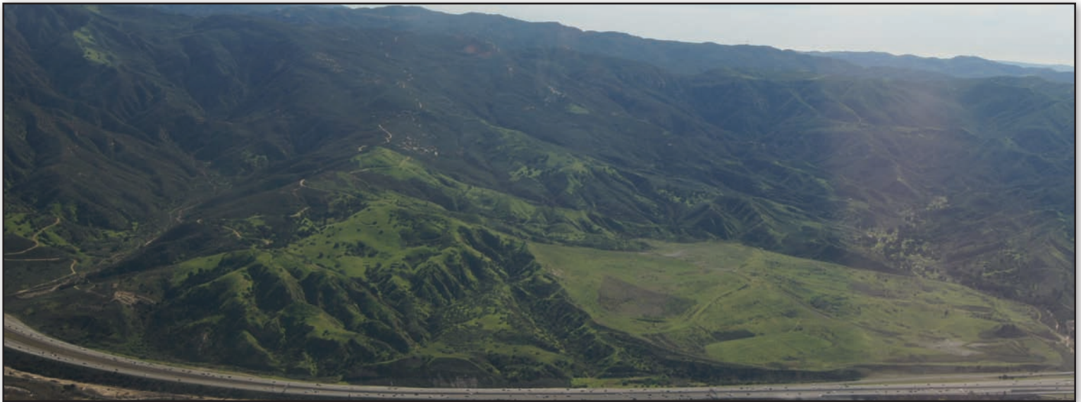
Coal Canyon is shown on the far left adjacent to the 91 freeway. Part of The Irvine Company's proposed donation are the hills to the right (west) of Coal Canyon.

The addition of Coal Canyon to Chino Hills State Park in 2000-2001 connected our Puente-Chino Hills to the large area of the Santa Ana Mountains, providing safe passage for wildlife underneath the 91 freeway.