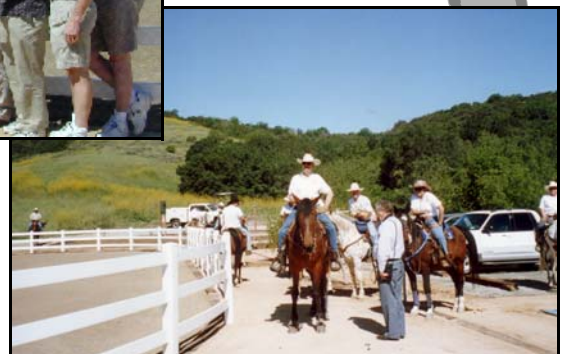
The Habitat Authority sponsored a ribbon cutting for the new center.