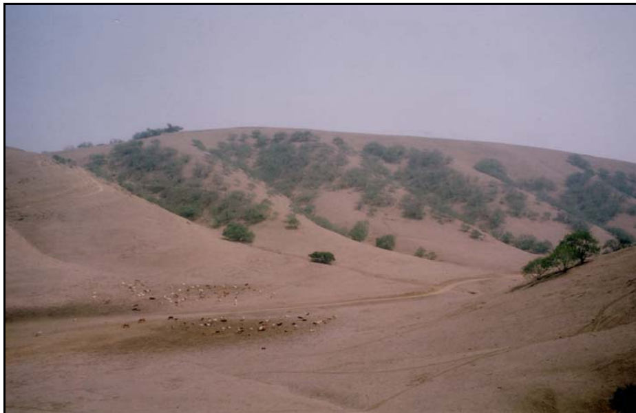
High density housing proposed here in Aera's Hidden Valley.