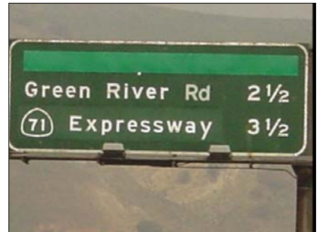
Freeway signs eliminate reference to Coal Canyon.

Mitigation funds from the Puente Hills Landfill provide the revenue stream needed for purchase and permanent protection of the land. The same opportunity exists at Brea's Olinda Landfill. The County of Orange is planning to expand that landfill operation for another eight years, until 2021.