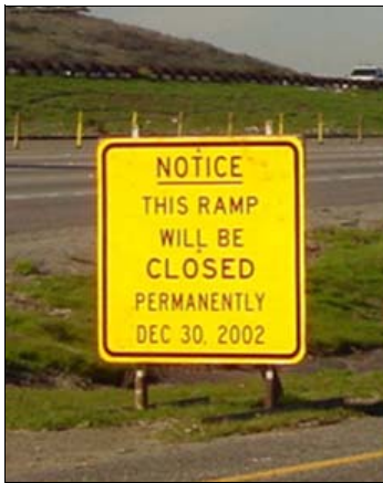
CalTrans announces permanent closure of the on and off-ramps along the 91 Freeway at Coal Canyon.