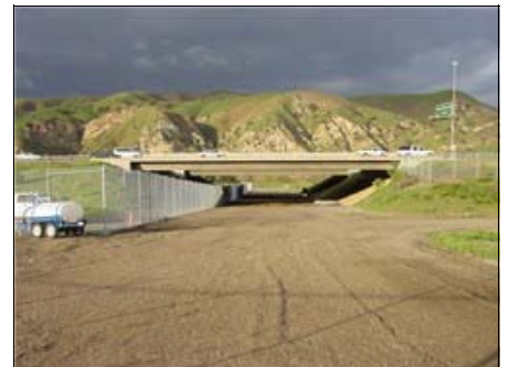
Asphalt has been removed and fencing re-aligned to guide wildlife under the freeway.