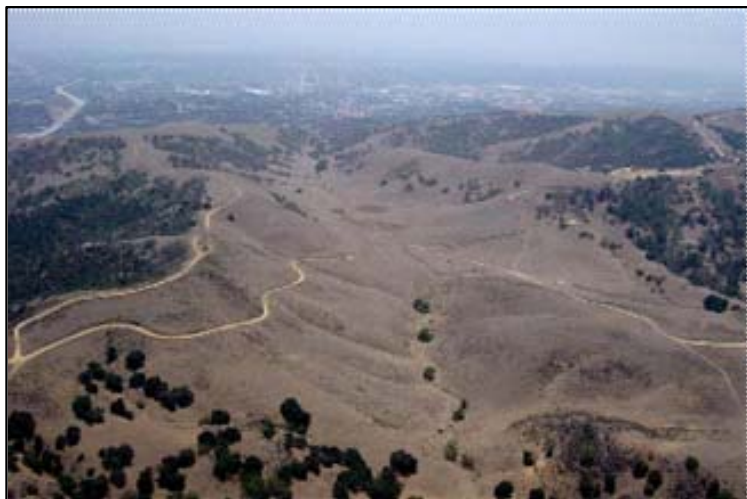
The Unprotected Middle of the Puente-Chino Hills Wildlife Corridor