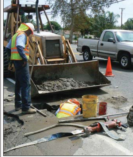
Employees of Monte Vista Water District dig out a leak in a lateral line Monday morning on Riverside Drive east of East End Avenue. Some of the affected water lines date to 1948, a district