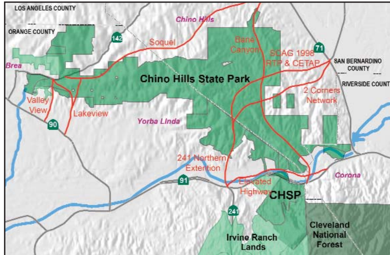
HFE prevailed but if planners had their way six roads would have cut through the State Park.

Hills For Everyone forced MWD to recirculate its Environmental Impact Report on the road it proposed through Chino Hills State Park. Comments on the revised document were filed in early January. The proposed MWD road would cut through Chino Hills State Park and the habitat lands supposedly protected by a 1996 Habitat Conservation Plan. The Department of Fish and Game (DFG) has thus far refused to approve mitigation, taking seriously the commitment made by MWD, State Parks, Shell, the U.S. Fish & Wildlife Service, and DFG that the area would be protected. The road would parallel the State Park's hiking trail on the steep south wall in Telegraph Canyon, the formal Orange County entrance to the State Park. MWD believes building a two lane paved road into a secluded area will somehow enhance the security of its facility. We believe it is designed to relieve complaints from Yorba Linda residents who bought newly built houses along the existing MWD access road on the south side.