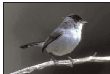
A federally threatened California gnatcatcher.

Smack dab in the middle of this remarkable natural landscape and this highly engineered human landscape, lie the Puente-Chino Hills. Local lore maintains that untold treasures still lie buried in the hills but in reality the treasures lie above ground: along the streams, walnut woodlands, oak forests, grasslands, coastal sage scrub and chaparral where rare wildlife still abide. Coastal California gnatcatchers, herds of mule deer, golden eagles and southwestern pond turtles are among the rarities that inhabit the region.