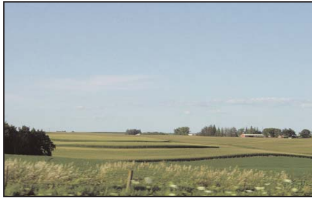
Iowa's landscape is relatively flat and has no unique species.

quakes) provided species with many opportunities to change. This calliope of movement created hills, mountains and slopes that allowed