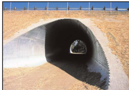
A typical wildlife underpass.

With funding and approvals in place, the Habitat Authority and the L.A. County Department of Public Works is in the process of building a wildlife underpass under Harbor Boulevard in the City of La Habra Heights. This wildlife underpass will allow an increase of genetic exchange and foraging capabilities among wildlife and will reduce roadkill along Harbor Boulevard. By ensuring safe passage for wildlife, motorists as well will be protected from collisions with migrating animals.