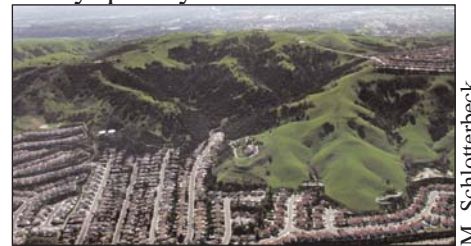
Shell-Aera's hills seen from the 57 Freeway.

Shell-Aera's proposal for 3600 housing units, three commercial centers and a golf course is going through the approval process very slowly. L.A. County is not quite sure why the project is delayed so much. We suspect its proposal has created an array of negative impacts that cannot be mitigated. The plan would carve up the hills, add 40,000 car trips a day to our roads and sever the Wildlife Corridor. Shell-Aera is cooperating with the City of Industry and is hoping Industry's Tonner Canyon highway becomes a reality quickly.