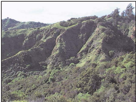
Warm climate, varied terrain help create varied habitats.

If topography literally lays the groundwork upon which so many life forms emerged, ocean influenced weather and temperate climate open the door.