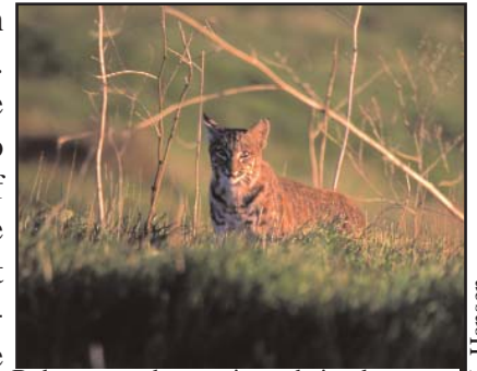
Bobcats use the terrain to their advantage.

backbone of 10,000-foot high mountains so close to the coast. We live atop rocks that are nine million years old and some that are compressed into a new form with each new earthquake. Scientists assure us there is no other region of comparable size in the nation that has greater biodiversity than we have right here in southern California.