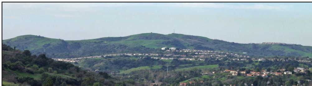
Shell-Aera's property from Diamond Bar, looking southwest.