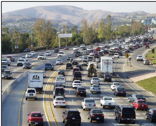
AERA land in background, 57 Freeway in foreground

Traffic: 14,000 new houses will mean 140,000 extra vehicle trips per day on local streets and freeways... and the loss of our ridgelines.