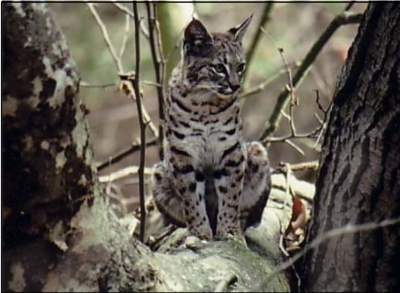
Bob - A local cat in a cool tree

To submit your artwork, send it to: info@hillsforeveryone.org