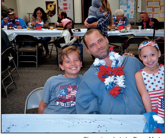
Champion

planesoffame.org. •Chapter 14 and the 335th Assault Helicopter Company Cowboys will commemorate the 50th anniversary of